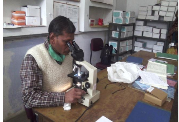
Microscopy by Lab Technician at DMC Sec10

They are socially, economically backward and marginalized. Health facilities in this area are very pathetic. People are suffering due to lack of basic civil facilities. The population of this area cannot be accurately censused because of the frequent in and out of people from this area. The development of women and children residing in the target area are in risk due to lack of health and educational facilities. Majority of the population belongs to lower class. The living condition is also pathetic. Half of the children in this area below 14 yrs are going for work. And DMC Saidnagali is covering very remote of the rural area. There are lack of health facilities and awareness.