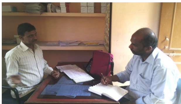
Executive Director of KNEUS program discuss with KNEUS staff at Bhangel DMC

Ever since KNEUS signed Memorandum of Understanding (MoU) with District Tuberculosis Officer (DTO) on behalf of District Health Society (DHS) on 29.10.2003 it has registered and treated 26,500 Tuberculosis patients so far in this colony and villages till 2016 December. Year- wise details are given below.