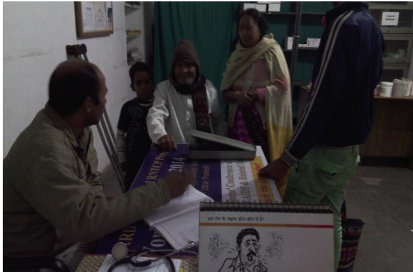
Diagnosis by Medical Officer at DMC Sec-10

KNEUS has 3 Designated Microscopic Centers (DMCs) of Revised National Tuberculosis Control Program (RNTCP) under Public Private Partnership with the Government of U.P. in Bhangel and Sec-10 of GautamBudh Nagar and Saidnagali of J.P.Nagar district. Most of the population living in the two urban DMCs, Bhangel, Sec-10 is migrants and unauthorized settlement consists of more than 2.5 lakhs.